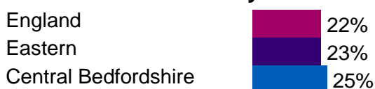
Chart 1. Proportion of workers on zero hours contracts by area

Around a quarter (25%) of the workforce in Central Bedfordshire were on zero-hours contracts. Around two thirds (59%) of the workforce usually worked full-time hours and 41% were part-time.